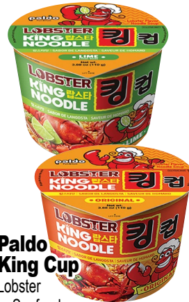
Paldo King Cup Lobster or Seafood 3.88 oz.