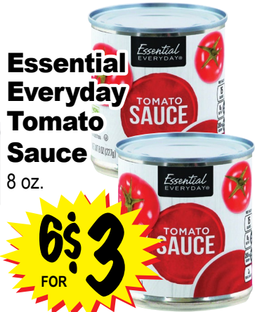
Essential Everyday Tomato Sauce 8 oz.