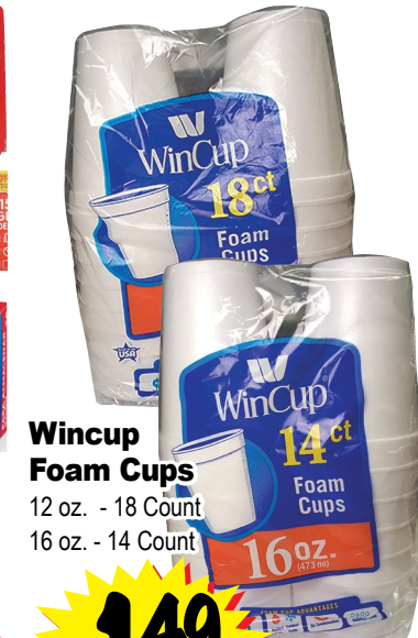
WinCup Foam Cups 12 oz. - 18 Count 16 oz. - 14 Count