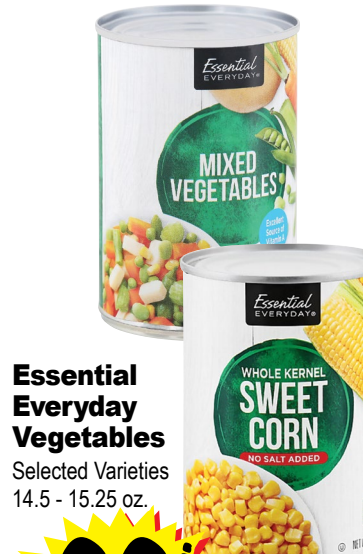
Essential Everyday Vegetables Selected Varieties 14.5 - 15.25 oz.