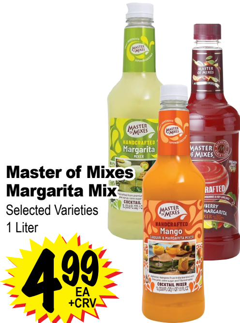
Master of Mixes Margarita Mix Selected Varieties 1 Liter