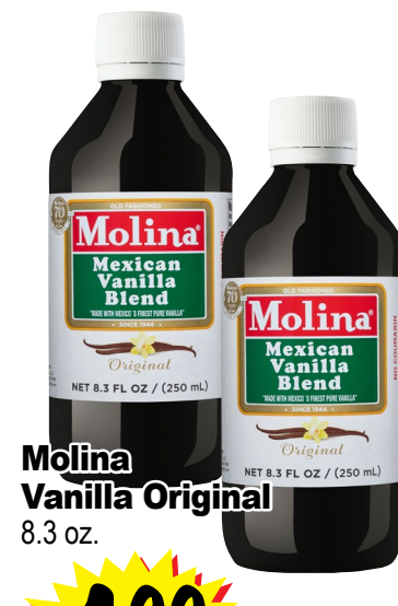
Molina Mexican Vanilla Original 8.3 oz.