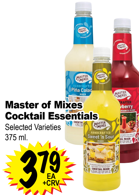
Master of Mixes Cocktail Essentials Selected Varieties 375 ml.