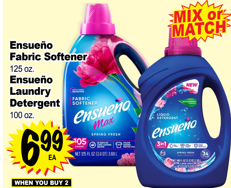
Ensueño Fabric Softener 125 oz. Ensueño Laundry Detergent 100 oz.