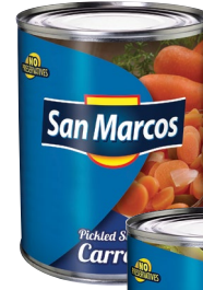
San Marcos Sliced Carrots, Sliced Nacho