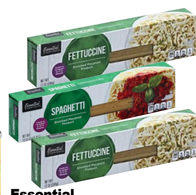
Essential Everyday Pasta Selected Varieties 12 - 16 oz.