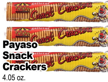
Payaso Snack Crackers 4.05 oz.