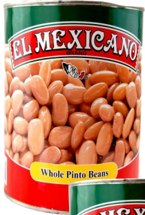
El Mexicano Whole Pinto Beans 29 oz.