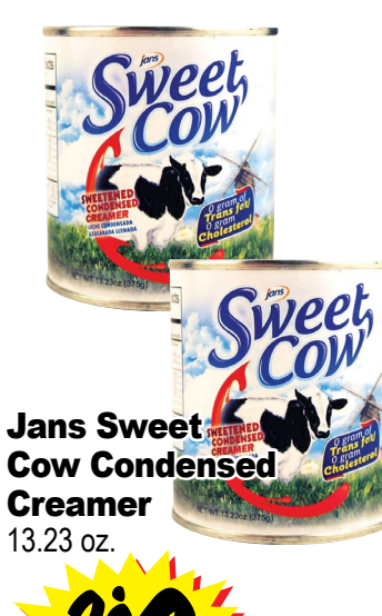
Jans Sweet Cow Condensed Creamer 13.23 oz.