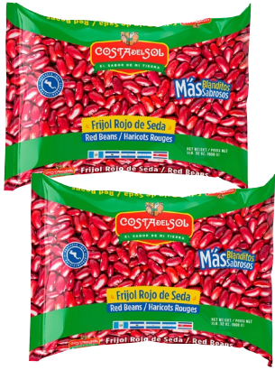
Costa Del Sol Red Beans 32 oz.