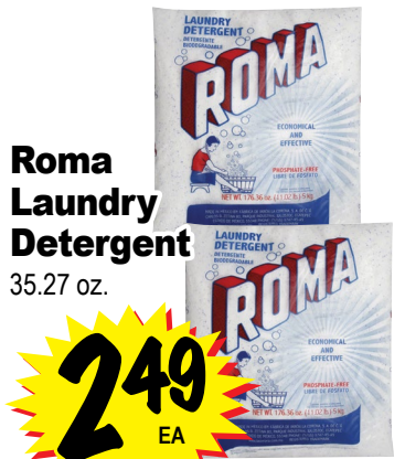
Roma Laundry Detergent 35.27 oz.