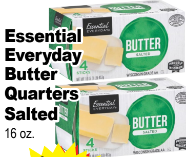
Essential Everyday Butter Quarters Salted 16 oz.