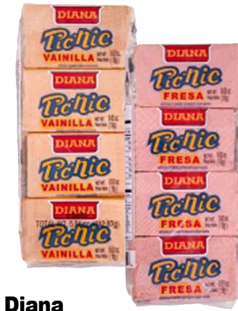
Diana Pic-Nic Wafer 8 Pack / 4.8 oz.