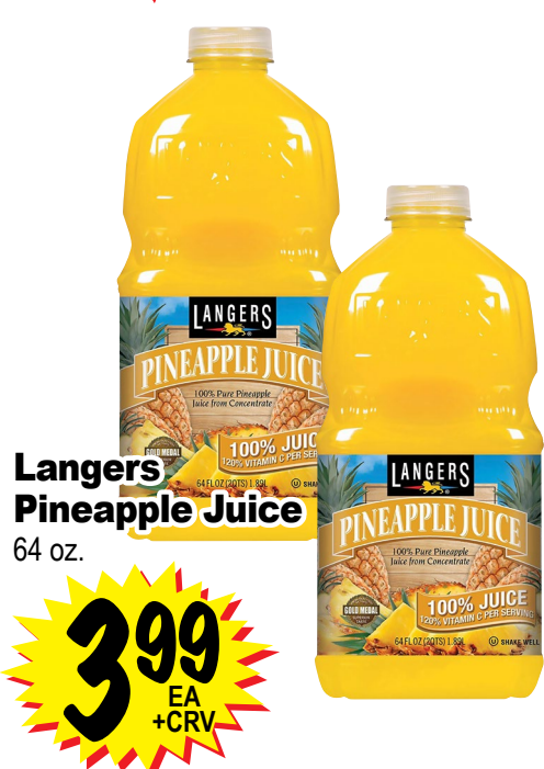
Langers Pineapple Juice 64 oz.