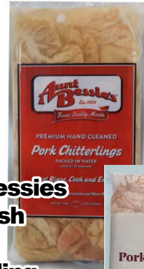
Aunt Bessies or Danish Crown Chitterling 5 lb.