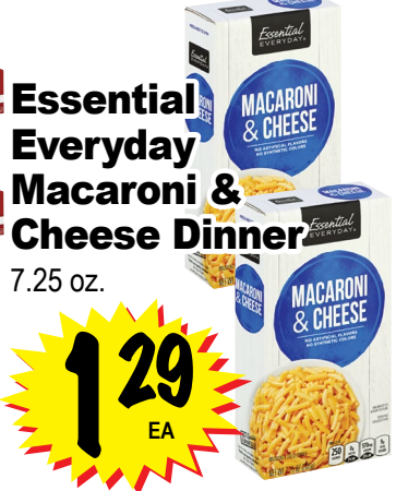
Essential Everyday Macaroni & Cheese Dinner 7.25 oz.