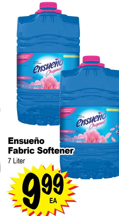
Ensueño Fabric Softener 7 Liter