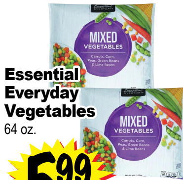
Essential Everyday Vegetables 64 oz.