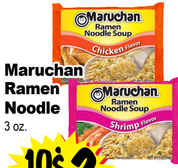
Maruchan Ramen Noodle 3 oz.