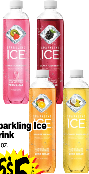
Sparkling Ice Drink 17 oz.