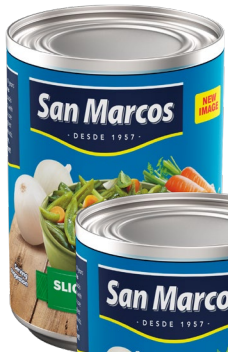
San Marcos Sliced Jalapenos 26 oz.