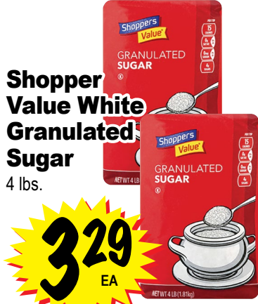
Shopper Value White Granulated Sugar 4 lbs.