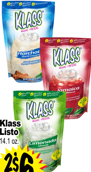
Klass Listo 14.1 oz.