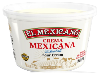
El Mexicano Crema Mexicana or Oaxaqueña 16 oz.