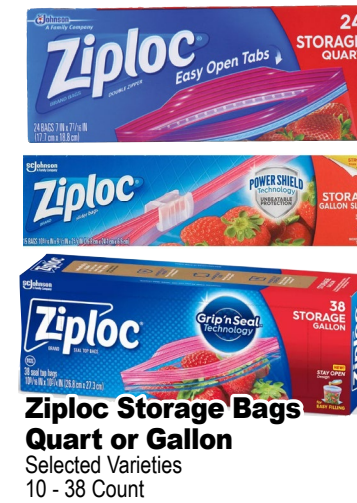
Ziploc Storage Bags Quart or Gallon Selected Varieties