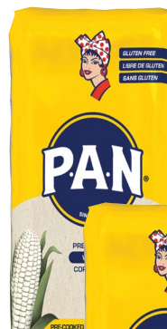
P.A.N. White Corn Flour 2.2 lb.