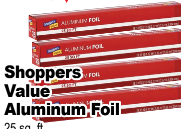
Shoppers Value Aluminum Foil 25 sq. ft.