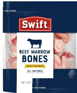
Swift Beef Marrow Bones 2.2 lb.