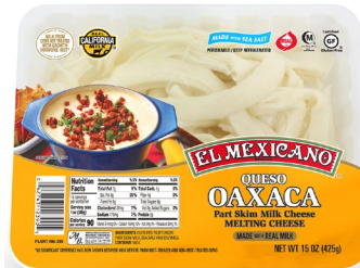
El Mexicano Queso Oaxaca or Cotija 15 oz.