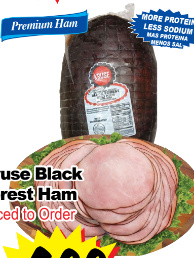
Kruse Ham Sliced to Order