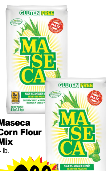
Maseca Corn Flour Mix 4 lb.