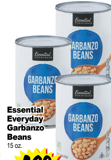
Essential Everyday Garbanzo Beans 15 oz.