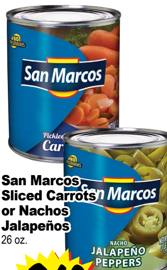
San Marcos Sliced Carrots or Nachos Jalapeños 26 oz.