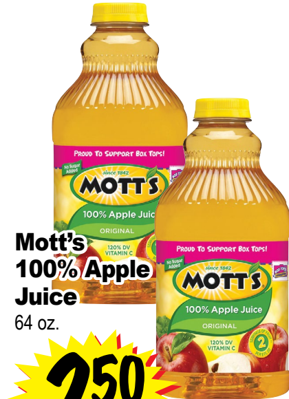
Mott's 100% Apple Juice 64 oz.