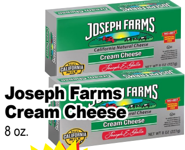
Joseph Farms Cream Cheese 8 oz.