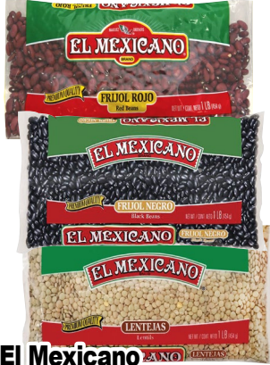
El Mexicano Black, Red Beans, Lentils 1 lb.