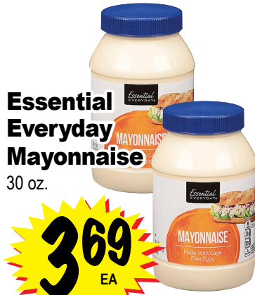
Essential Everyday Mayonnaise 30 oz.