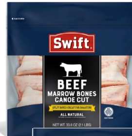
Swift Beef Marrow Canoe Cut 2.1 lb.