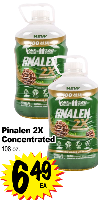
Pinalen 2X Concentrated 108 oz.