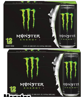
Monster Energy Drinks Selected Varieties 12 Pack / 16 oz.