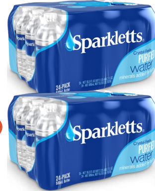
Sparkletts Drinking Water 24 Pack / 16.9 oz.