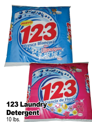
123 Laundry Detergent 10 lbs.