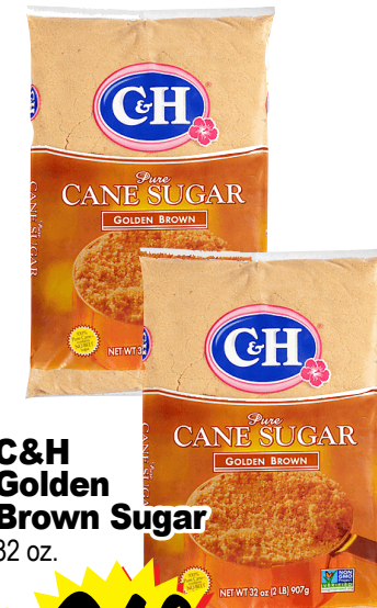
C&H Golden Brown Sugar 32 oz.