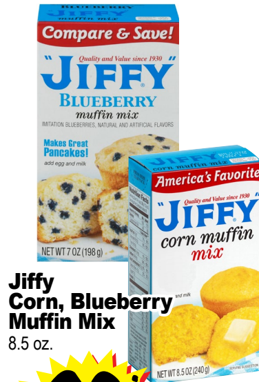
Jiffy Corn, Blueberry Muffin Mix 8.5 oz.