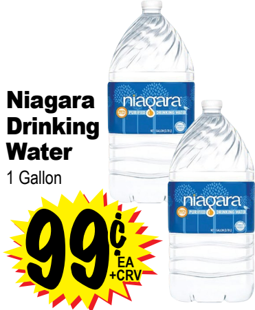
Niagara Drinking Water 1 Gallon