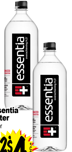
Essentia Water 1 Liter