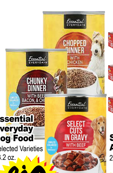
Essential Everyday Dog Food Selected Varieties 13.2 oz.