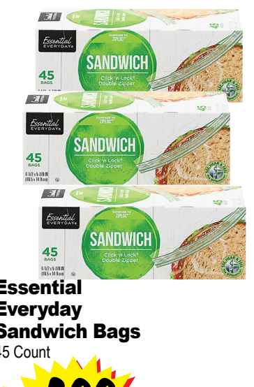
Essential Everyday Sandwich Bags 45 Count