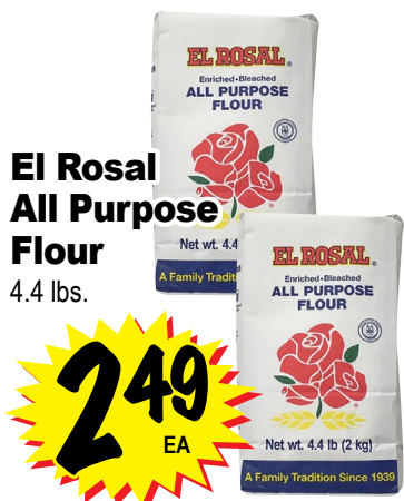
El Rosal All Purpose Flour 4.4 lbs.