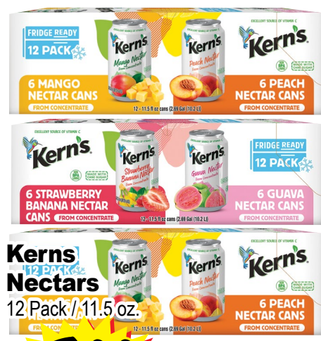
Kern's Nectars 12 Pack / 11.5 oz.