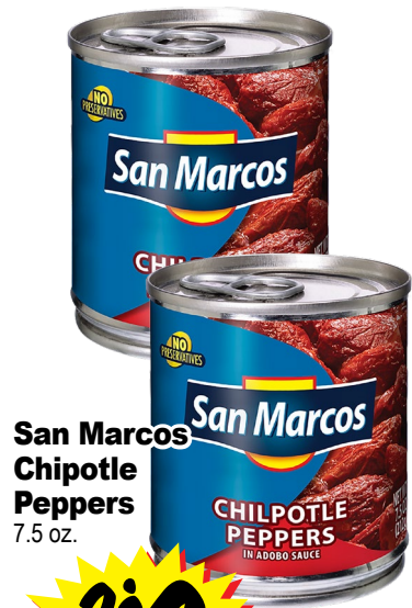
San Marcos Chipotle Peppers 7.5 oz.