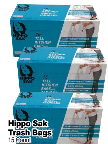
Hippo Sak Trash Bags 15 Count