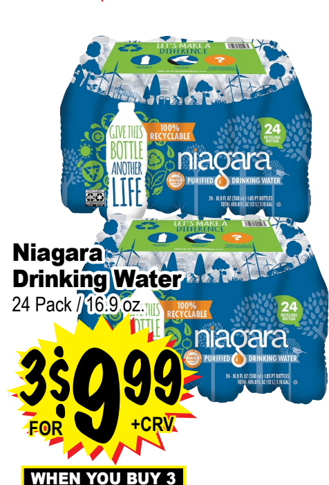
Niagara Drinking Water 24 Pack / 16.9 oz.