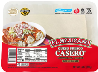
El Mexicano Queso Fresco Cremoso, Casero or Panela 14 oz.