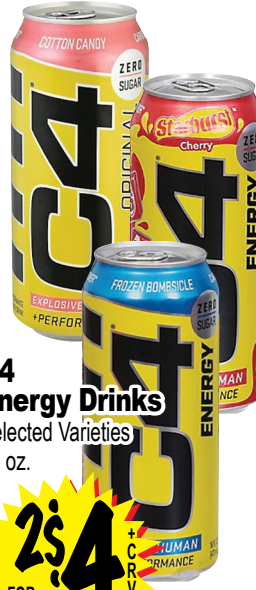
C4 Energy Drinks Selected Varieties 16 oz.