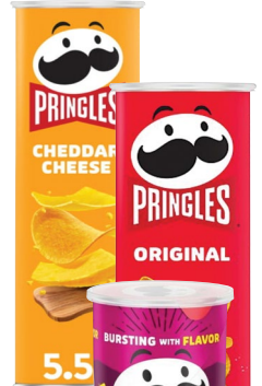
Pringles Chips 5.25 oz.