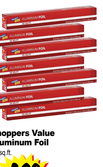
Shoppers Value Aluminum Foil 25 sq.ft.