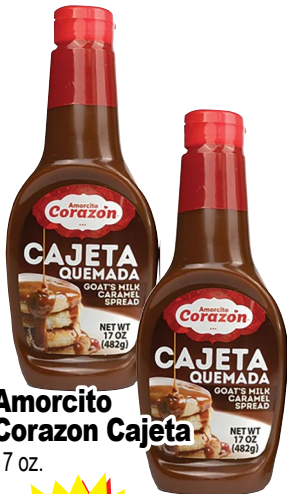
Amorcito Corazon Cajeta 17 oz.