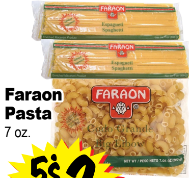
Faraon Pasta 7 oz.