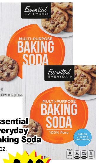
Essential Everyday Baking Soda 16 oz.