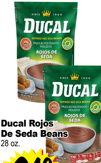
Ducal Rojos De Seda Beans 28 oz.