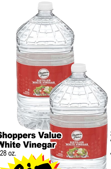
Shoppers Value White Vinegar 128 oz.