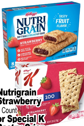
Nutrigrain Strawberry 8 Count or Special K Pastry Crisp Strawberry 5.28 oz.