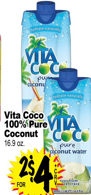
Vita Coco 100% Pure Coconut 16.9 oz.