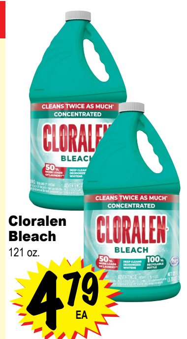
Cloralen Bleach 121 oz.