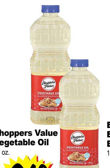
Shoppers Value Vegetable Oil 40 oz.