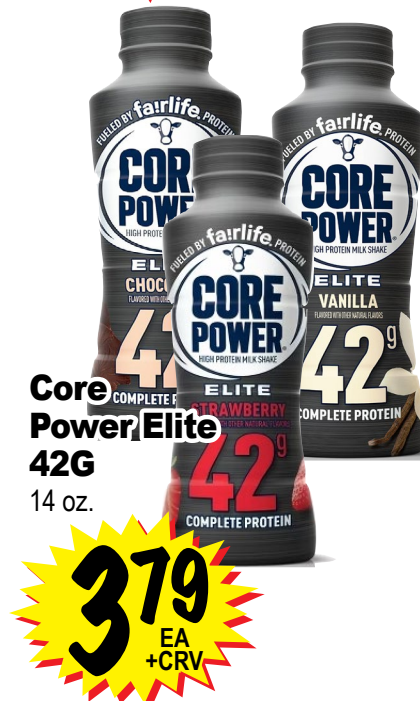
Core Power Elite 42G 14 oz.