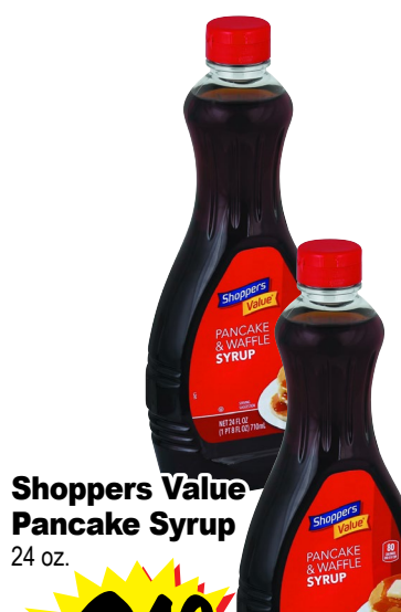
Shoppers Value Pancake Syrup 24 oz.