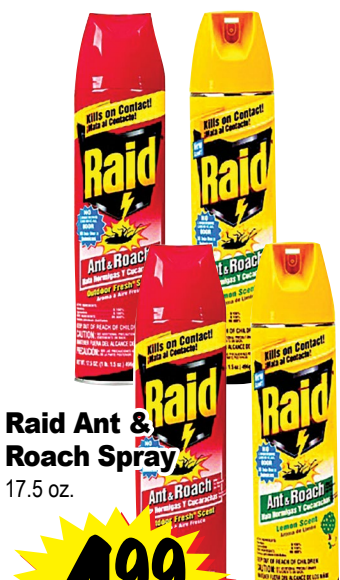
Raid Ant & Roach Spray 17.5 oz.