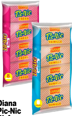
Diana Pic-Nic Wafers 4.8 oz.