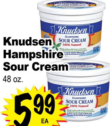
Knudsen Hampshire Sour Cream 48 oz.