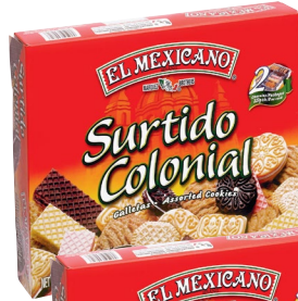
El Mexicano Surtido Colonial 16 oz.