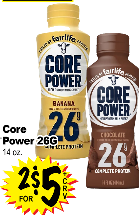
Core Power 26G 26g 14 oz.