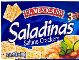
El Mexicano Saladinas 13.86 oz.